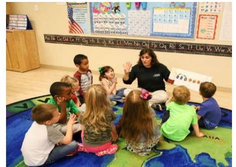
Mirame –Look at me ! Spanish in our Classrooms

We had our quarterly Quality Assessment last month . All of our children loved sharing what they are learning.