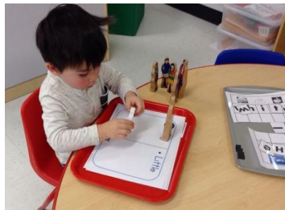
Our Children Shined in our "Centers That Shine"

We had our quarterly Quality Assessment last month . All of our children loved sharing what they are learning.