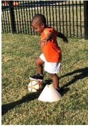
Soccer Shots and Funkey Kids