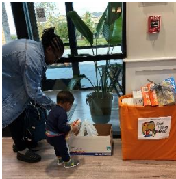
Supporting our community St. Jude Walk a Thon Richmond-Rosenberg Helping Hands and Toys for Tots